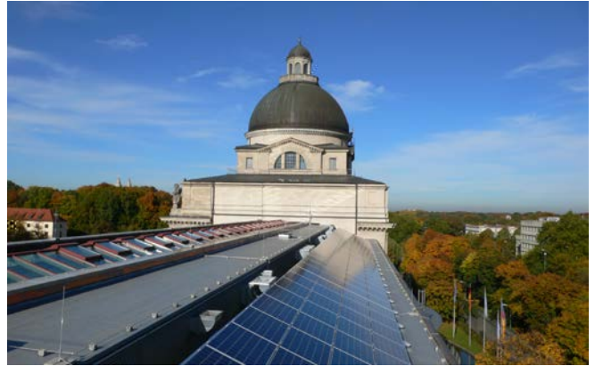
PC05 Trina Solar modules.

Tradition and modernity go hand in hand in Bavaria – and that also goes for the energy system and supply in this economically-strong Southeastern German state. The Bavarian State Chancellery, official residence of Horst Seehofer, Prime Minister of the State of Bavaria, is supplied with solar energy from a PV array. Covering a roof area of 800 square metres, the array generates 70 MWh of solar electricity, which is used by the State Chancellery directly. OneSolar International, a project developer for PV systems and wholesaler for solar products, installed the PV system on the heritage-protected building, using, 296 TSM-